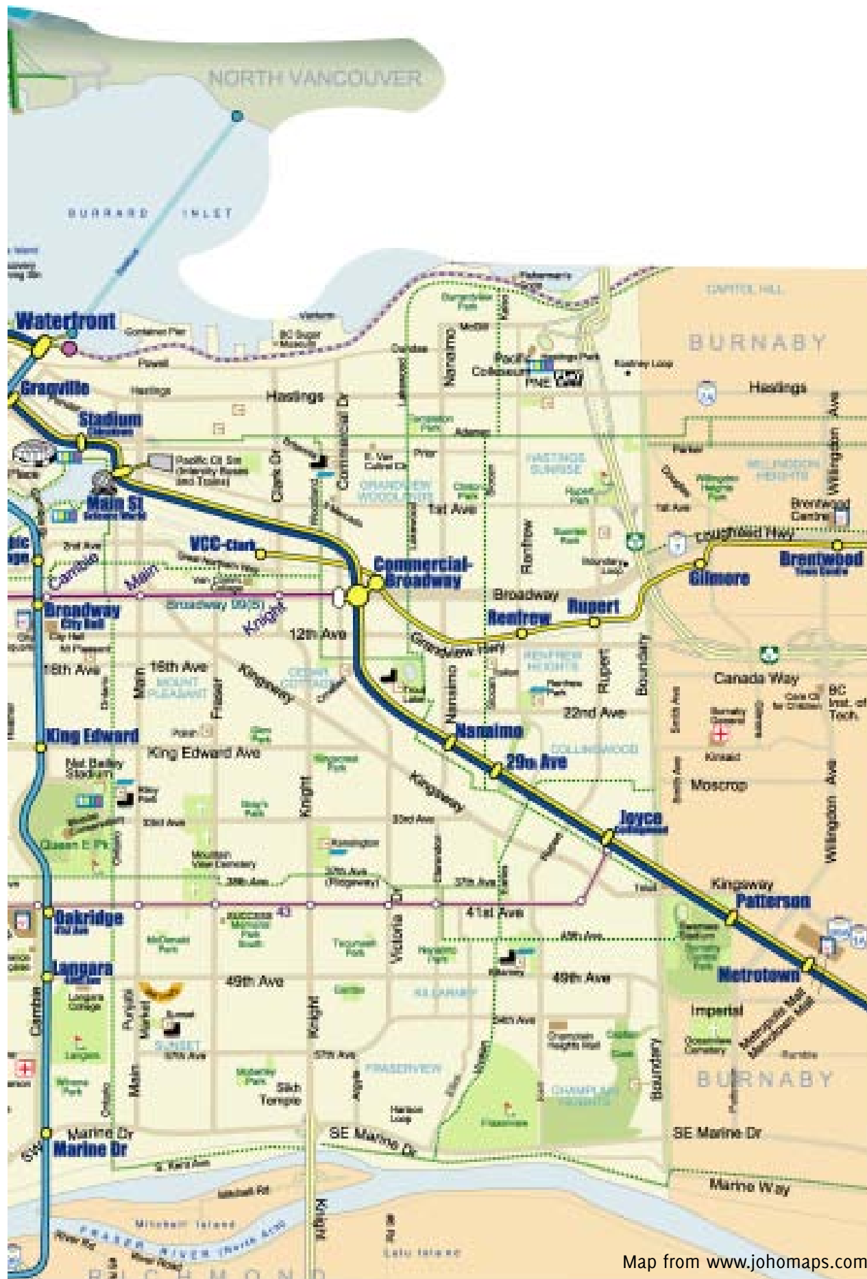
Map from www.johomaps.com