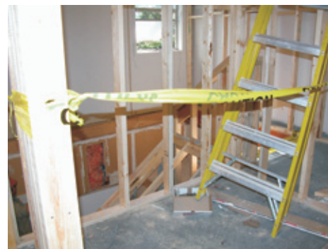
PIMS-UBC Site Renovations: The new lecture room (left), and the interior staircase (right).