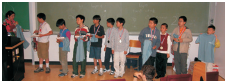
The top ten ELMACON 2004 winners in Grade 5