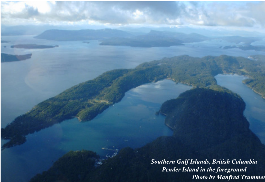
Southern Gulf Islands, British Columbia Pender Island in the foreground

PIMS is supported by: The Natural Sciences and Engineering Research Council of Canada The Government of the Province of Alberta The Government of the Province of British Columbia The Alberta Ministry of Innovation and Science The British Columbia Ministry of Competition, Science, and Enterprise Simon Fraser University University of Alberta University of British Columbia University of Calgary University of Victoria University of Washington University of Northern British Columbia University of Lethbridge