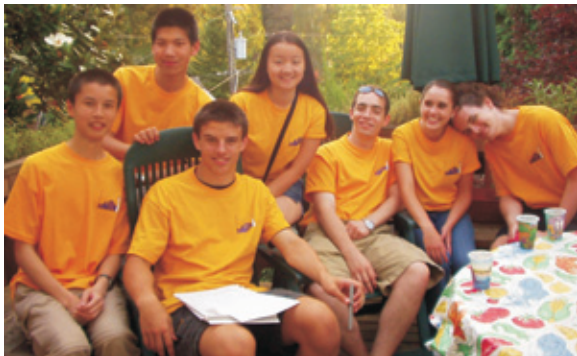
Participants in SIMUW 2003