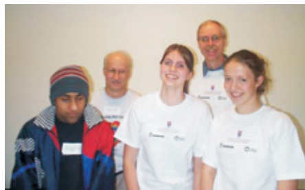
At the BC Colleges High School Mathematics Contest

The BC Colleges' High School Mathematics Contest has always been about participation and not competition. In this respect it is a wonderful mathematics outreach activity.