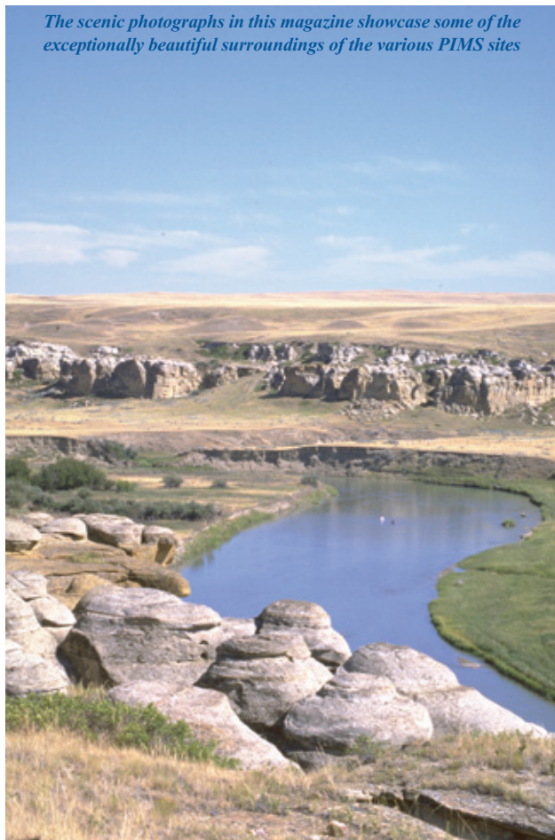
The scenic photographs in this magazine showcase some of the exceptionally beautiful surroundings of the various PIMS sites

See New BIRS Scientific Director on page 5