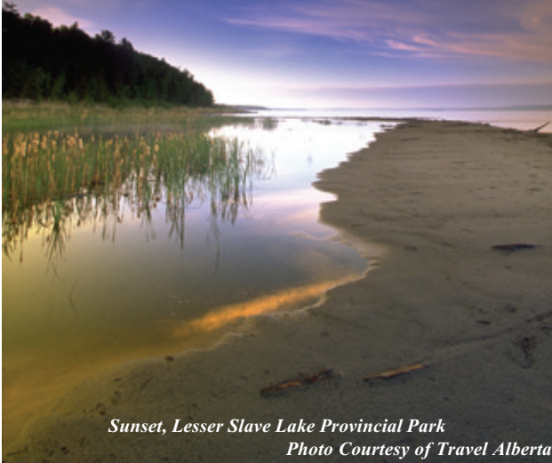
Sunset, Lesser Slave Lake Provincial Park