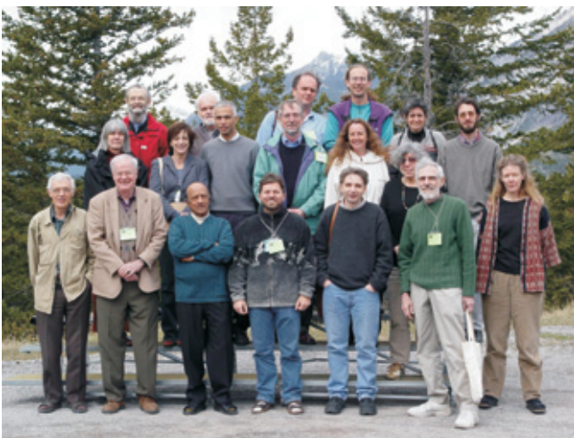
Participants at the 2004 BIRS Creative Scientific Writing Workshop

The first was called, "What, Why, and For Whom?" It covered a lot of ground, from lamenting math phobia and emphasizing the need for better science and mathematics education, to considering the many forms that outreach can